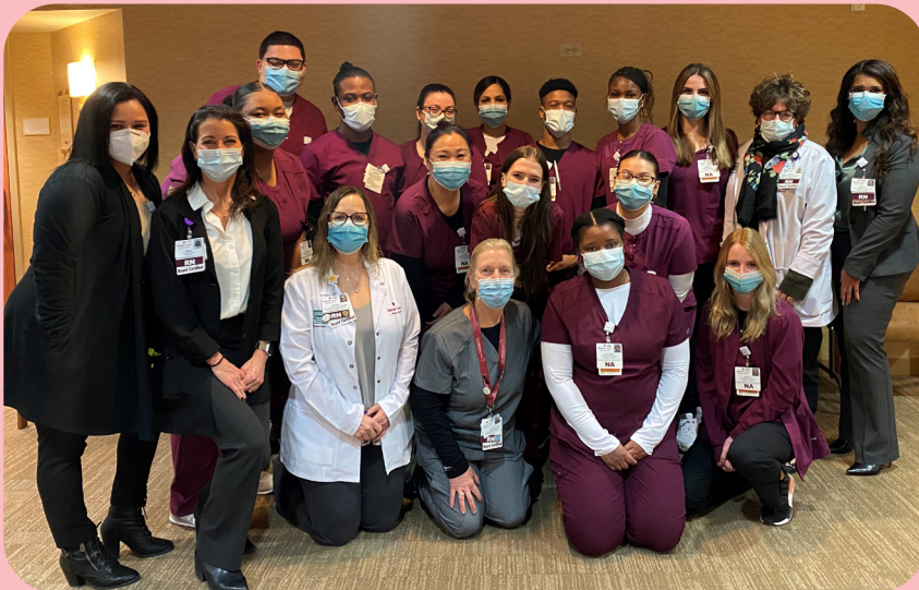
Congratulations to the first Nursing Assistant Program Class of 2022.

Nursing Leadership, Nursing Professional Development and the Nursing Assistant team collaborated to develop a Nursing Assistant Program. This internal educational program will enhance our Nursing Assistant Pool and will be offered four times a year. Candidates will spend a week in class and receive hands-on training. Topics include medical terminology, age-related aspects of care, safe patient handling and computerized documentation. The classes will be taught by GHMC Nursing Leaders with special internal guest speakers.