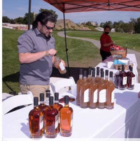
Spirits Lab tasting at West Hills Country Club