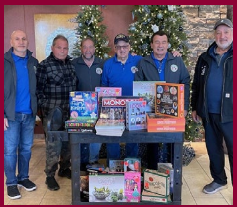
The Central Orange County Italian American Association delivered its annual toy donation to the Pediatric Center.