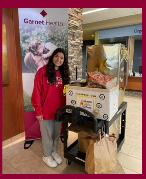
Minisink Valley National Honor Society donated toys this Christmas (as they do every Christmas) in a show of its members' support and generosity.