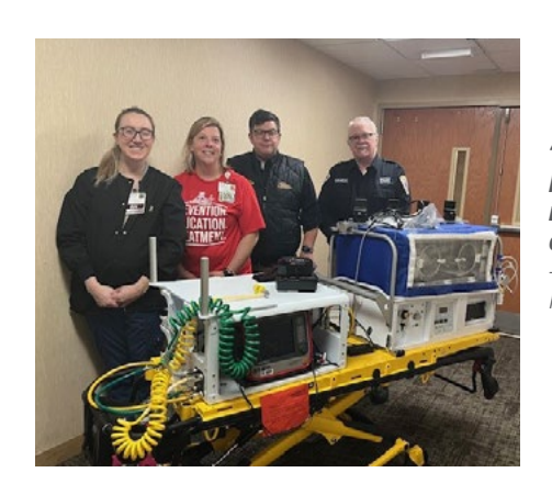
"We are so grateful to be able to transport our infants who need increased care."

The Garnet Health Foundation funded an $182,286 neonatal transportation isolate used to transport infants to Garnet Health Medical Center's neonatal ICU. Over 50 cases are transferred annually to the Middletown campus, while about 50 of our most critical infants are transferred from Middletown to Westchester Medical Center.