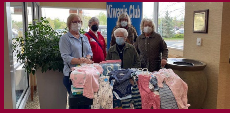
The Middletown Kiwanis Annual Baby Shower provided a generous cornucopia of clothes and diapers. These items were given to the Rowley Family Birthing Center and handed out to families upon discharge.