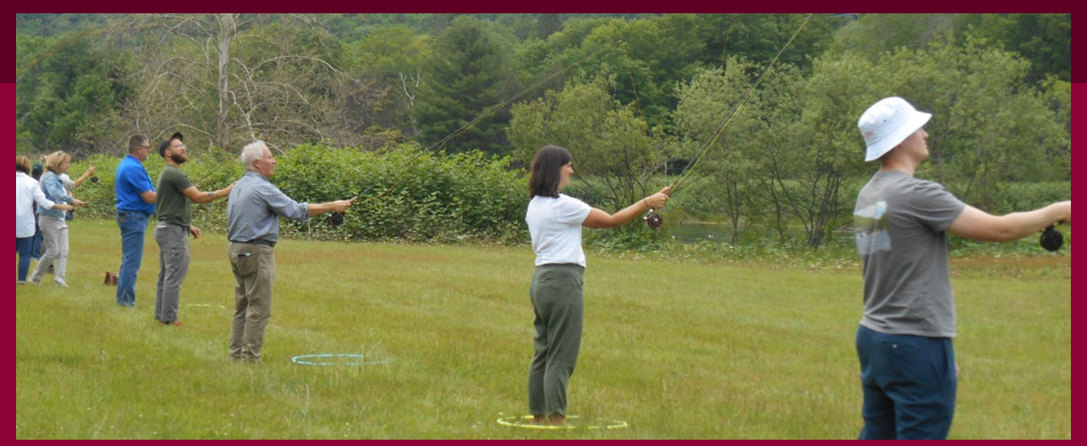
Casting instruction in action