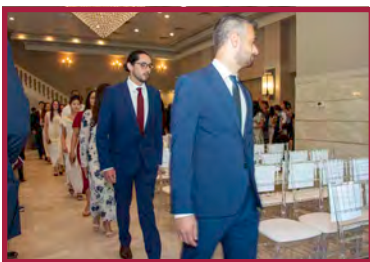
Residents make their entrance at the graduation ceremony.