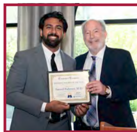
Chief Academic Officer Touro College of Osteopathic Medicine, Harlem/Middletown/Montana.