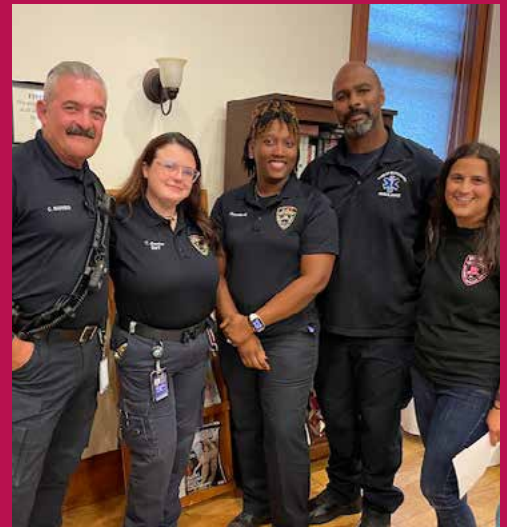
Village of Montgomery police officers visit the Senior Center during the event.