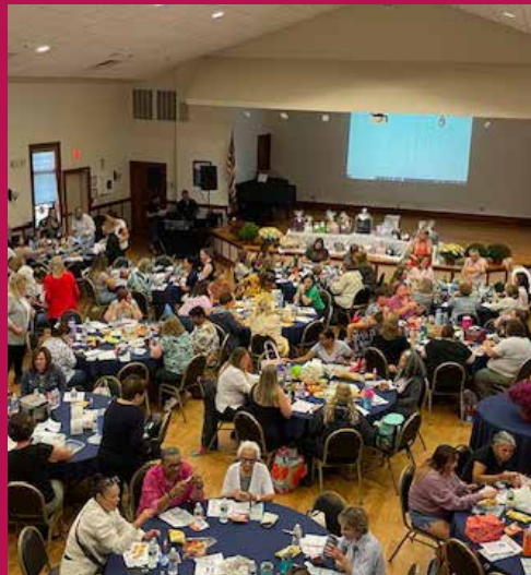
Overview of the bingo event