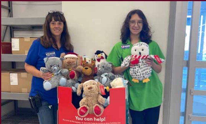
PetSmart donated new stuffed animals to the Garnet Health Foundation. Bags full of bears have been distributed to departments ranging from urgent care and same-day surgery to diagnostic imaging and phlebotomy. PetSmart has supported the foundation with these donations for several years.